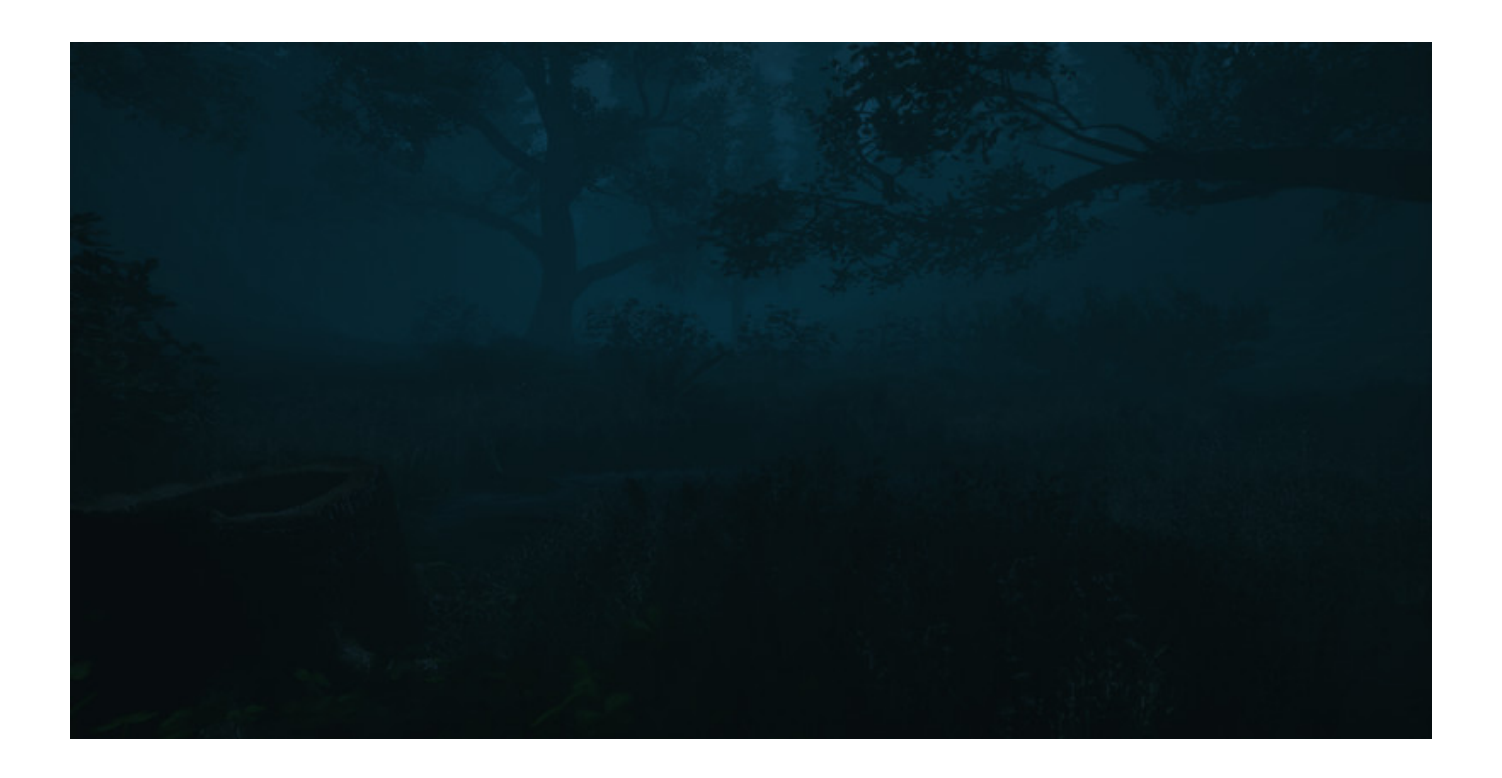
Sudoku3D 2: The Cube Patch 8 Download